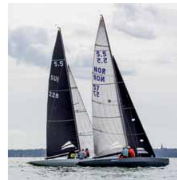
ARTEMIS XIV AND MARIE-FRANÇOISE XIX BATTLE FOR THE SCANDINAVIAN GOLD CUP

The conditions were in complete contrast to the previous day with sunshine, and