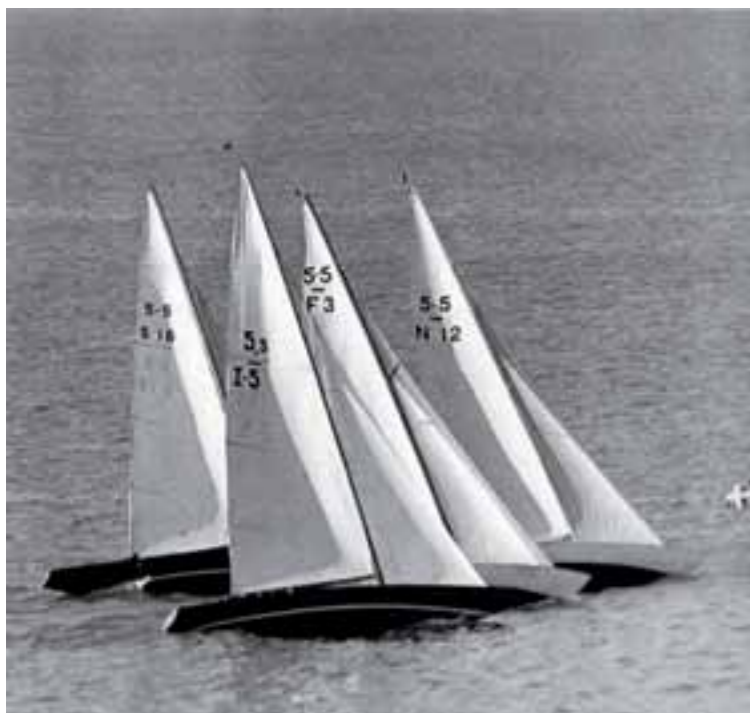
ABOVE: COPPA D'ITALIA IN 1954