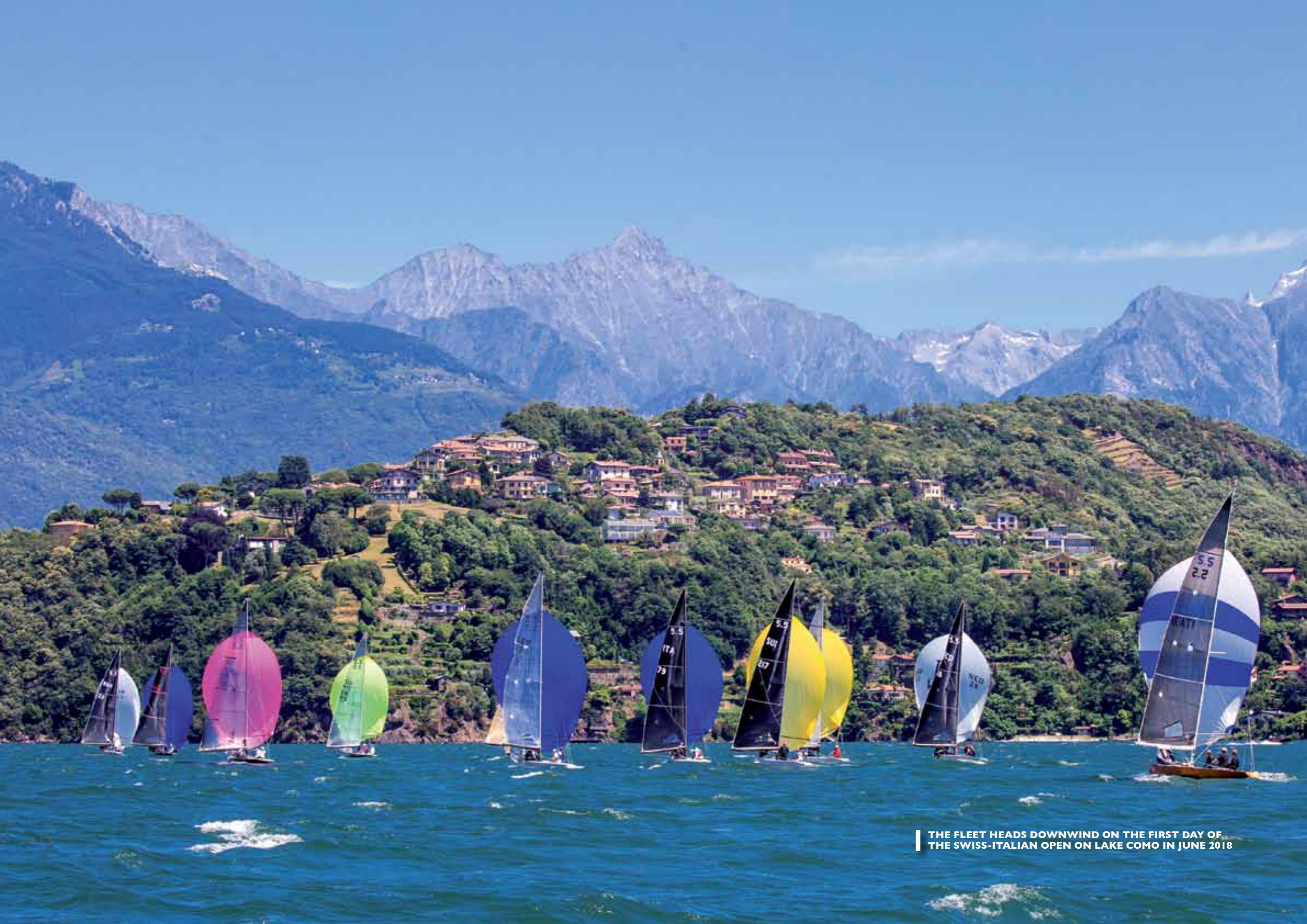
THE FLEET HEADS DOWNWIND ON THE FIRST DAY OF THE SWISS-ITALIAN OPEN ON LAKE COMO IN JUNE 2018