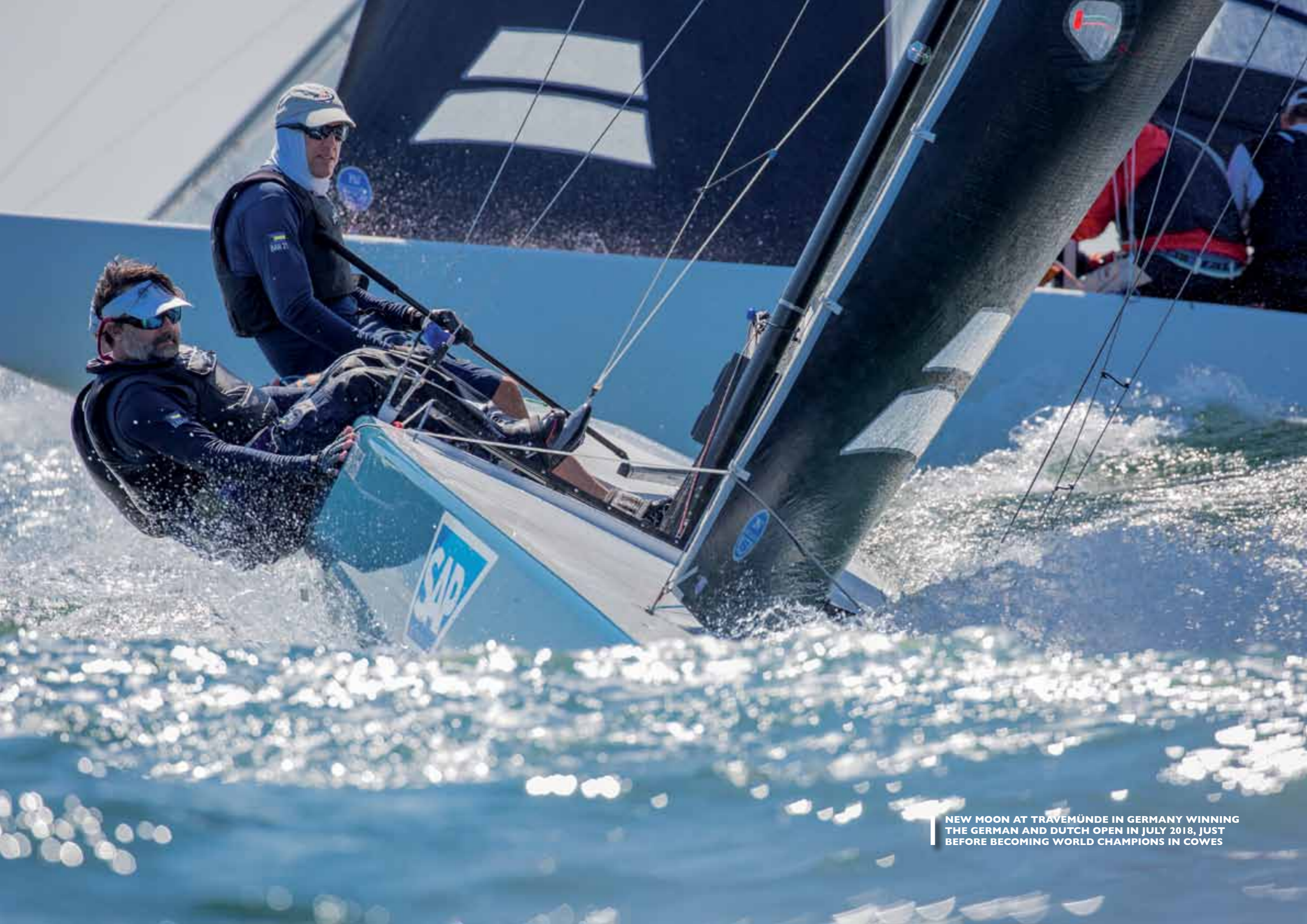
NEW MOON AT TRAVEMÜNDE IN GERMANY WINNING THE GERMAN AND DUTCH OPEN IN JULY 2018, JUST BEFORE BECOMING WORLD CHAMPIONS IN COWES